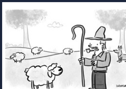
"I understand your concerns, but there's a chain of command. Have you spoken to the sheepdog?"