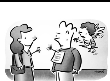
"If you could fill out the attached survey that would really help me out."